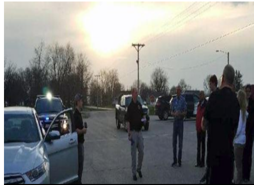
Above is the class discussing the traffic stop a student just finished conducting.