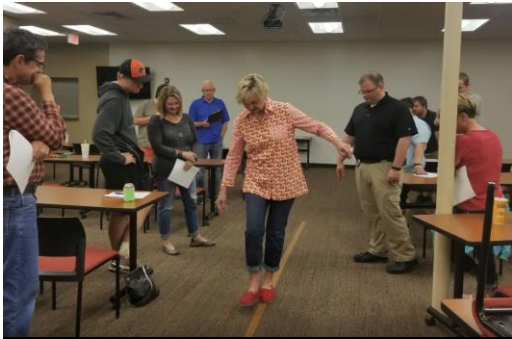
Above is a class participant running a volunteer through the field sobriety tests.